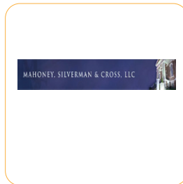
Mahoney, Silverman & Cross, LLC